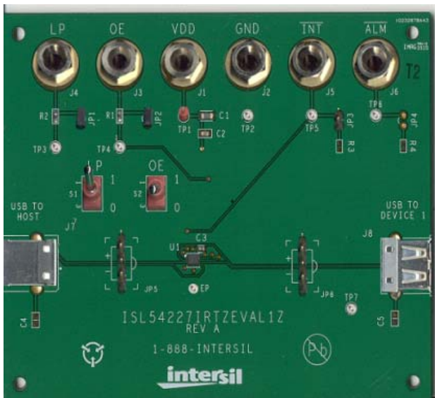
FIGURE 1. ISL54227IRTZEVAL1Z (REV A) EVALUATION BOARD