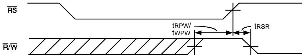
Figure 2. Reset Requirements