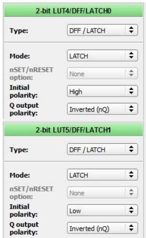
Figure 3. Latches configuration