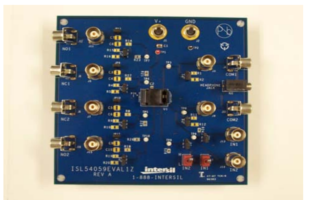
FIGURE 1. ISL54059EVAL1Z THROUGH ISL54064EVAL1Z EVALUATION BOARD