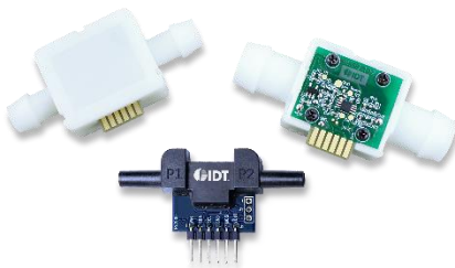
Figure 2. IDT’s FS2012 Sensor Module with Solid Flow Sensor Construction

Traditionally, MEMS mass flow sensors have been designed with a fragile membrane suspended over a vacuum-sealed cavity to provide thermal isolation. An alternative is to use porous silicon, which eliminates the need for a cavity (and diaphragm) while ensuring that there is a good thermal isolation between the heater and the sensing element (see example in Figure 2). Porous silicon (PS or pSi) is silicon with nanopores to increase the surface-to-volume ratio and has been proven effective as a thermal barrier. This solid construction allows the sensor die to be covered with various ceramic films (e.g., silicon carbide) to provide long-term stability and protect it from abrasive wear, as well as corrosive gases and liquids. Another common feature of MEMS flow sensors is the use of resistive elements to measure heat transfer and, by extension, mass flow. Resistors are simple to fabricate on silicon wafers, but are inherently noisy. A Wheatstone bridge or similar sensor interface can be used to minimize the impact of the sensor noise. An alternative is the use of thermopiles (i.e., thermocouples) with a very high signal-to-noise ratio. The output signal can be tuned by optimizing the number of thermocouples per thermopile, and the Seebeck coefficient can be optimized by tuning the dopant type and concentration. Thermopiles can be fabricated from polysilicon or metals (e.g., aluminum), and they are both commonly used in thermoelectric flow sensing.