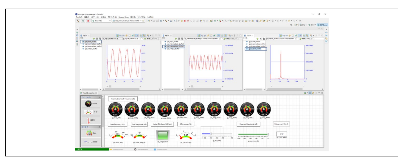
Figure 1 Console of e<sup>2</sup> studio

The sample program runs on the Renesas Starter Kit for RX231 (RSK) or the Target Board for RX231 (Target Board). Note that LCD display processing is supported only by RSK. See Figure 2 and 3.