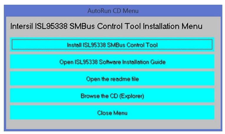
Figure 1. Installation Menu