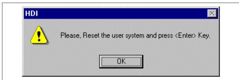
Figure 4 Dialog Box of the RESET Signal Input Request Message