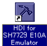
Figure 3 [HDI for SH7729 E10A Emulator] Icon