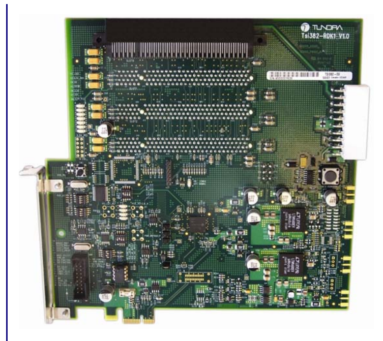
Figure 1 Tsi382 Evaluation Board

To evaluate the feature set of the Tsi382, IDT also offers an easy-touse Microsoft Windows based tool called "TsiView." This tool provides read and write access to an IDT "Tsi" PCle device's register settings. In addition, it can be used to program an on-board, serial EEPROM device with register settings that have been optimized by TsiView.