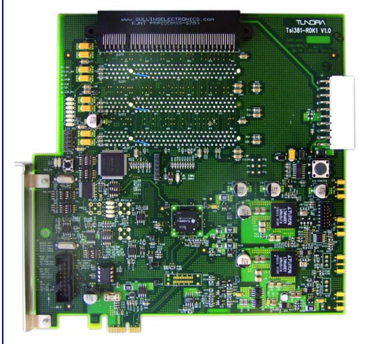
Figure 1 Tsi381 Evaluation Board

To evaluate the feature set of the Tsi381, IDT also offers an easy-touse Microsoft Windows based tool called "TsiView." This tool provides read and write access to an IDT "Tsi" PCIe device's register settings. In addition, it can be used to program an on-board, serial EEPROM device with register settings that have been optimized by TsiView.