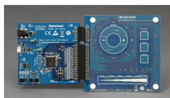
RA2L1 Touch RSSK