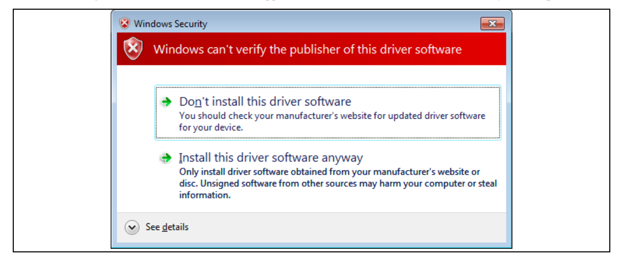
Figure 7-3 Installation Confirmation Screen

(4). If the following installation confirmation screen appears, click "Browse for driver software on your computer"