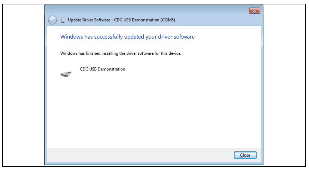
Figure 7-4 Installation Complete

(5). When the following window appears, the CDC driver has been successfully installed. Click "Close."