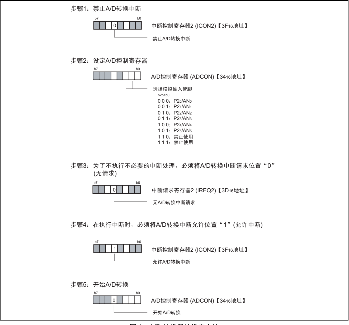
图 1 A/D 转换器的设定方法