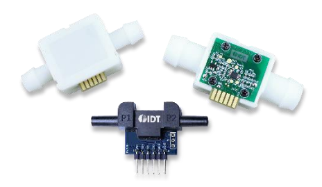
Figure 2. IDT's FS2012 Sensor Module with Solid Flow Sensor Construction

Traditionally, MEMS mass flow sensors have been designed with a fragile membrane suspended over a vacuum-sealed cavity to provide thermal isolation. An alternative is to use porous silicon, which eliminates the need for a cavity (and diaphragm) while ensuring that there is a good thermal isolation between the heater and the sensing element (see example in Figure 2). Porous silicon (PS or pSi) is silicon with nanopores to increase the surface-to-volume ratio and has been proven effective as a thermal barrier. This solid construction allows the sensor die to be covered with various ceramic films (e.g., silicon carbide) to provide long-term stability and protect it from abrasive wear, as well as corrosive gases and liquids. Another common feature of MEMS flow sensors is the use of resistive elements to measure heat transfer and, by extension, mass flow. Resistors are simple to fabricate on silicon wafers, but are inherently noisy. A Wheatstone bridge or similar sensor interface can be used to minimize the impact of the sensor noise. An alternative is the use of thermopiles (i.e., thermocouples) with a very high signal-to-noise ratio. The output signal can be tuned by optimizing the number of thermocouples per thermopile, and the Seebeck coefficient can be optimized by tuning the dopant type and concentration. Thermopiles can be fabricated from polysilicon or metals (e.g., aluminum), and they are both commonly used in thermoelectric flow sensing.