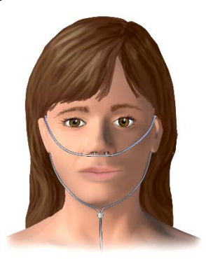
Figure 3. Patient Wearing Nasal Cannula and Nasal Cannula

The nasal cannula was invented by Wilfred Jones in 1949 and patented by the company he worked for, BOC (now Linde Group). Nasal cannulas are flexible tubes used to deliver supplemental oxygen to patients who need respiratory help. On one end, it connects to an oxygen supply (e.g., portable oxygen generator or wall connection at a hospital) and, on the other, it has a loop with two extended prongs with openings that fit into the patient's nostrils. The tubing is looped around the patient's ears or has an elastic head band to hold the cannula in place. Figure 3 shows a patient wearing a typical oxygen cannula and the cannula. For adults, a cannula delivers 1 to 5 liters of flow per minute with 28% to 44% oxygen content. Higher rates can dry out the patient's nose and cause bleeding over time. However, higher flow rates can be supported through a humidified nasal cannula. An inline flow meter can be used to monitor the flow through the cannula and can be used as a control feedback loop for the oxygen supply.