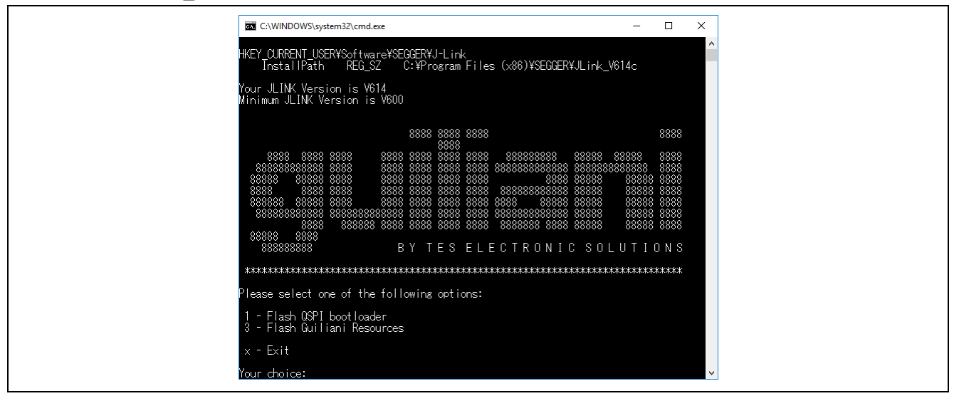
Figure 2. Application to flash GUI sample application (has menu options 1 and 3 only)