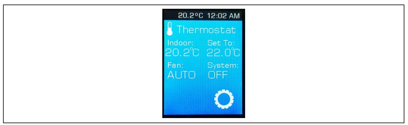
Figure 3 PK-S5D9 thermostat demonstration

In this demonstration, the SSP uses the A/D converter to read the internal temperature sensor of the MCU and displays this information on the LCD display shown in Figure 3.