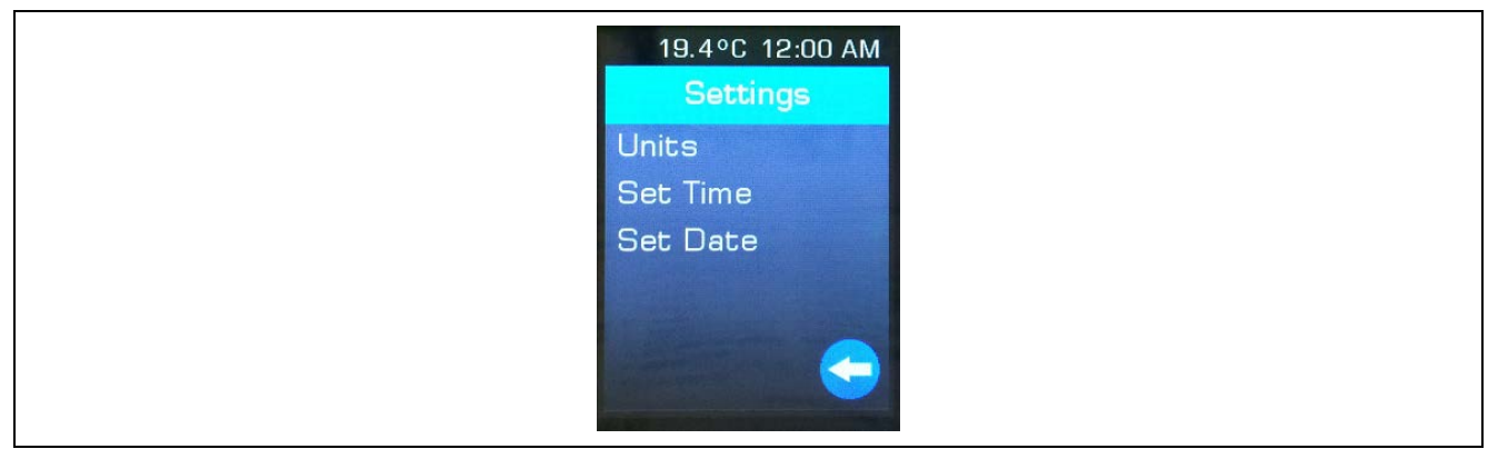
Figure 4 PK-S5D9 Units, Set Time, and Set Date