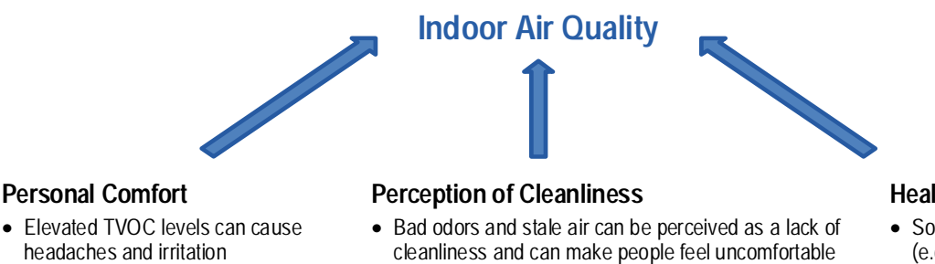
Figure 1 shows some of the reasons for concern about the TVOC inside buildings. The TVOC is considered an important indicator for indoor hygiene and indoor air quality (IAQ). In addition to serious health concerns, there is the psychological aspect; homes, offices, and other environments that smell clean typically seem more welcoming than areas with foul odors caused by organic compounds.

People can lose the ability to perceive scents if ٠ frequently exposed to odors