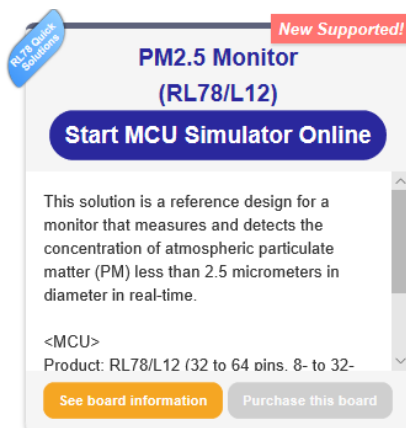
Figure 1 MCU Simulator Online sample project selection panel