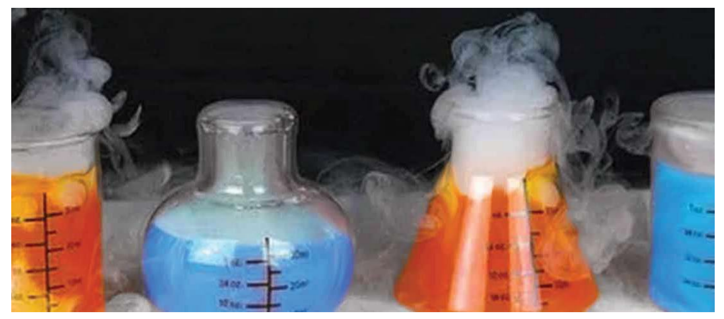
"In theory there's no difference between theory and practice. In practice there is."