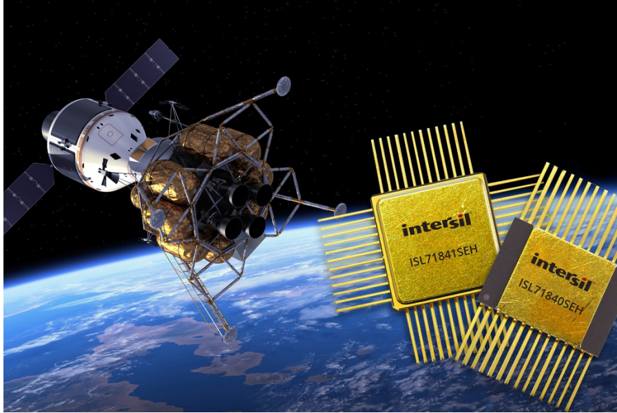
Figure 3. Rad hard ISL71840SEH 16-channel multiplexer and ISL71841SEH 32-channel multiplexer