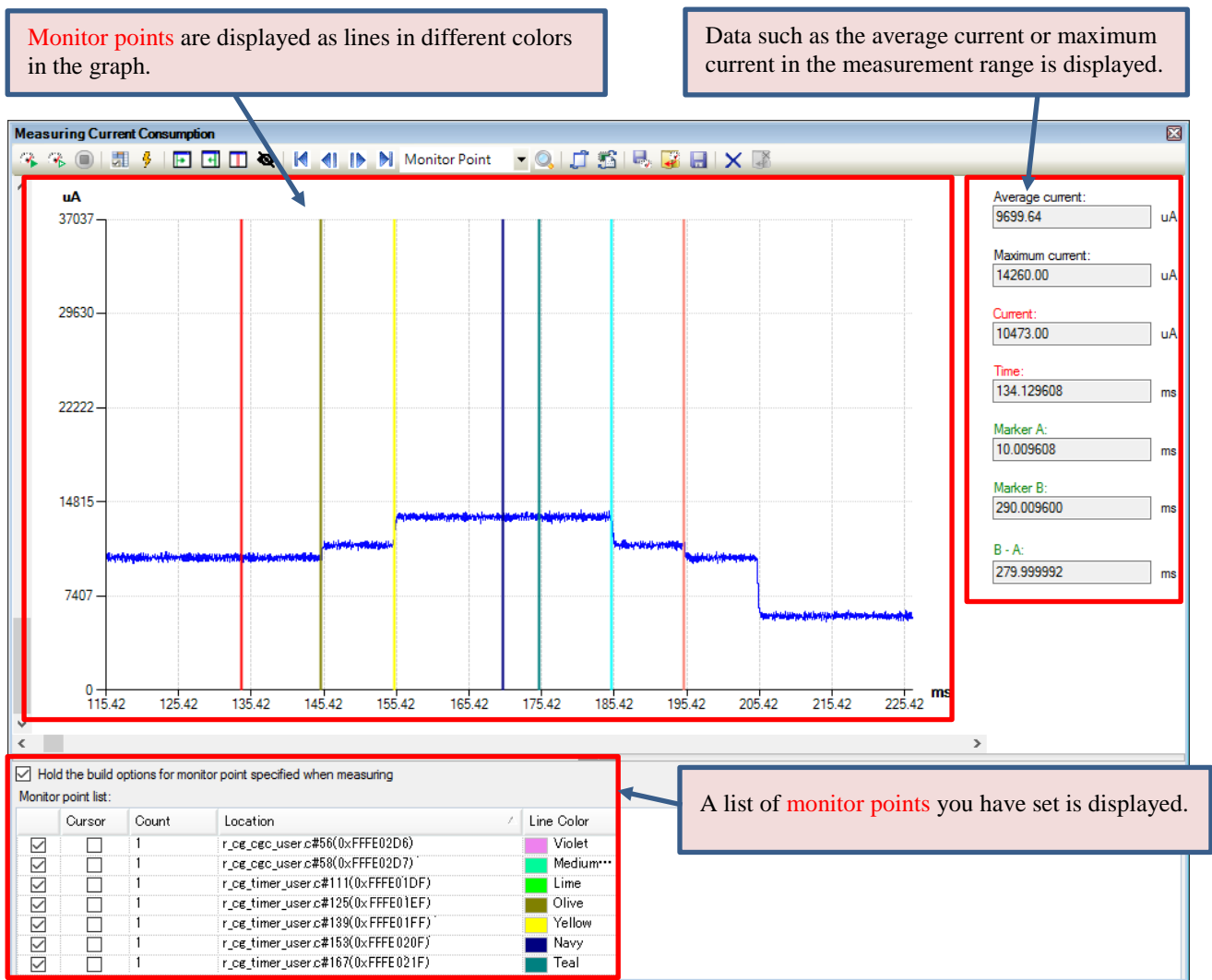
Figure 3 Function of Measuring Current Consumption