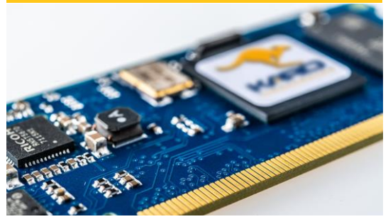
Extensive experience in the development and production of CoMs